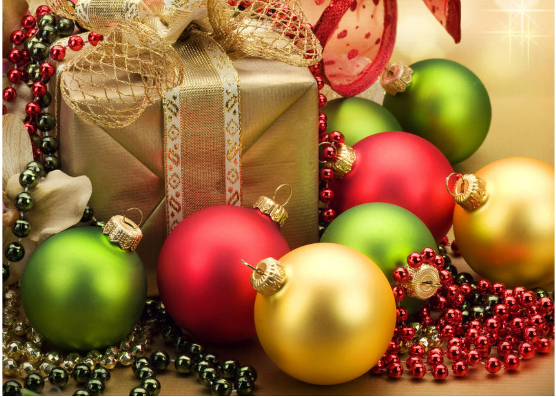
The BID would like to wish you all a very Merry Christmas and a Prosperous New Year 2023. The new Slough BID website will be launched shortlywatch this space for more details.