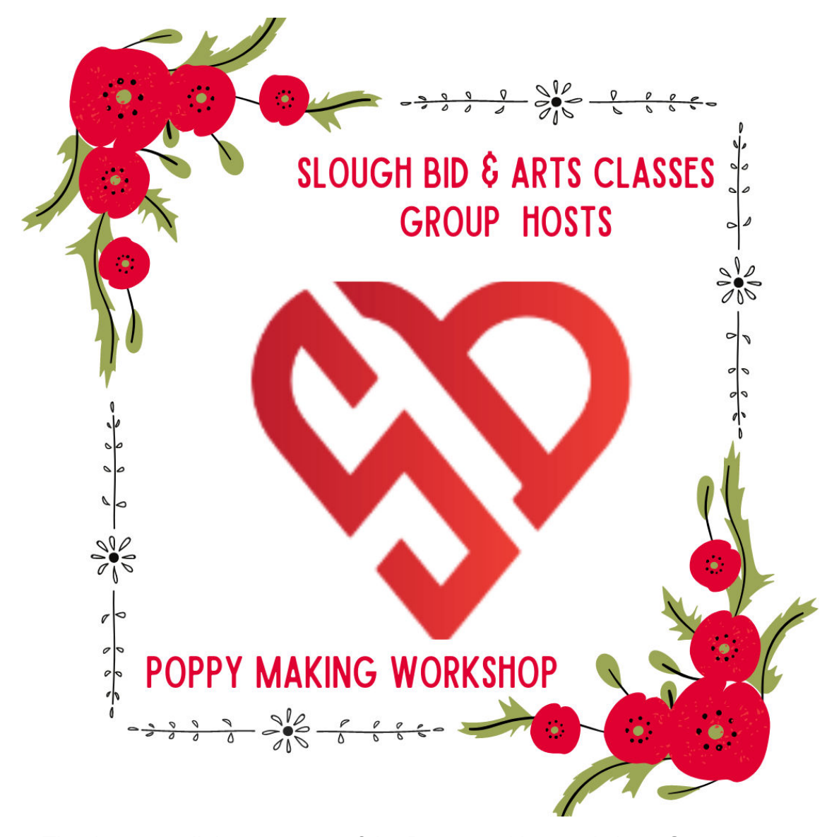
Thank you to all the sponsors of the Poppy making workshop: Queensmere /Observatory Shopping Centre, Slough Central.